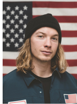
David Wise Olympic Gold Medalist