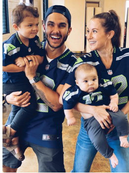
Carlos & Alexa PenaVega Hollywood acting couple